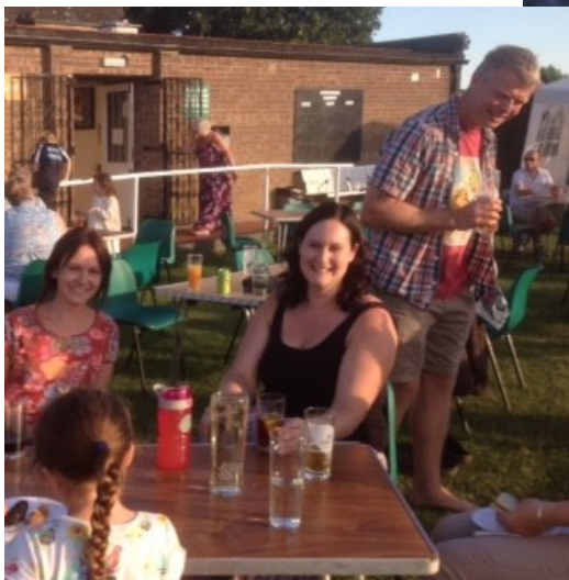
Family fun night