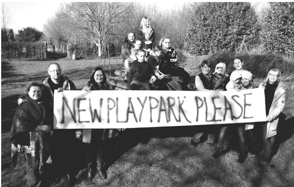
The start of the Greetham Community Play Area campaign