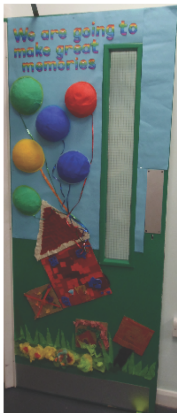
The After School Club decorated this door!

It is always lovely to hear news of old pupils, what they are up to now and what memories they have of Exton & Greetham CE Primary School.