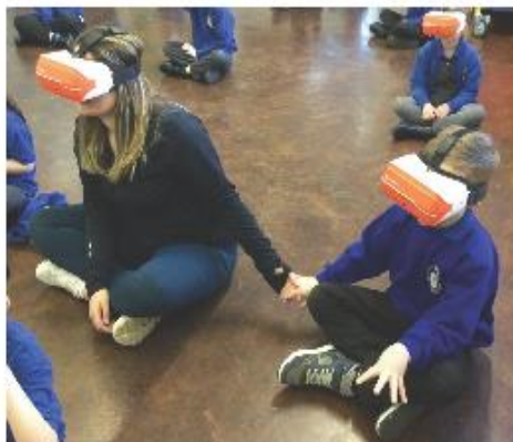
Adults were happy to hold a hand if you were unsure!

It was an amazing experience for all concerned – and great not to have to worry about the cost of coaches! We look forward to being able to use some of what we saw in our learning.