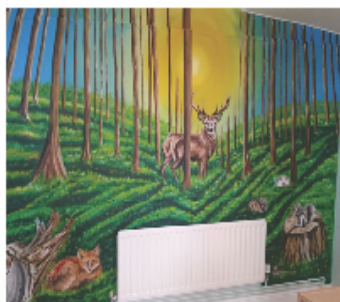
Our mural in our new library.

This term we have been developing our understanding of responsibility. From our youngest children taking responsibility for remembering what they need to bring to school each day, to our oldest children taking responsibility for challenging themselves in their learning, we have learnt that it is not easy being responsible! However,