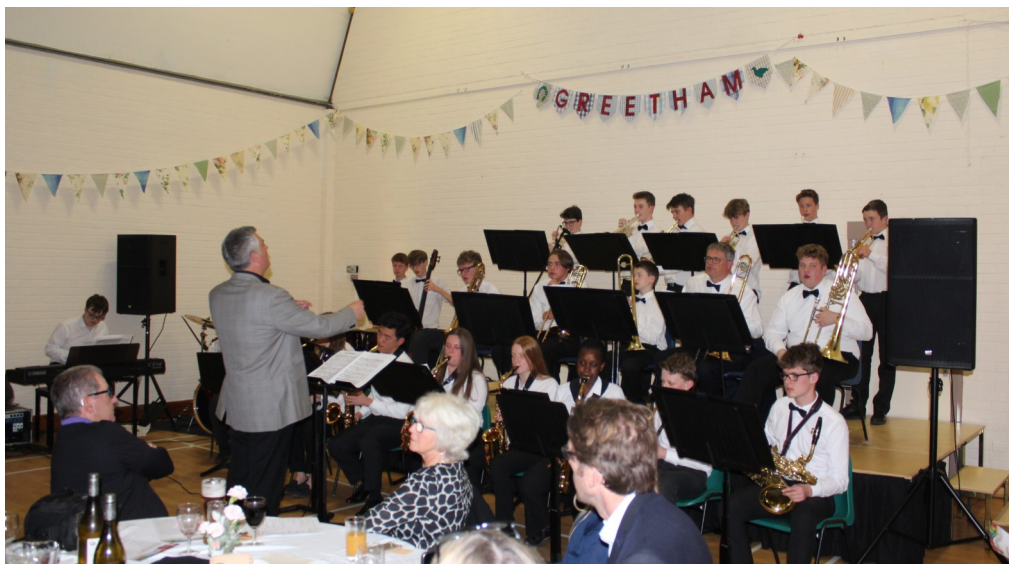
Oakham School Big Band concert