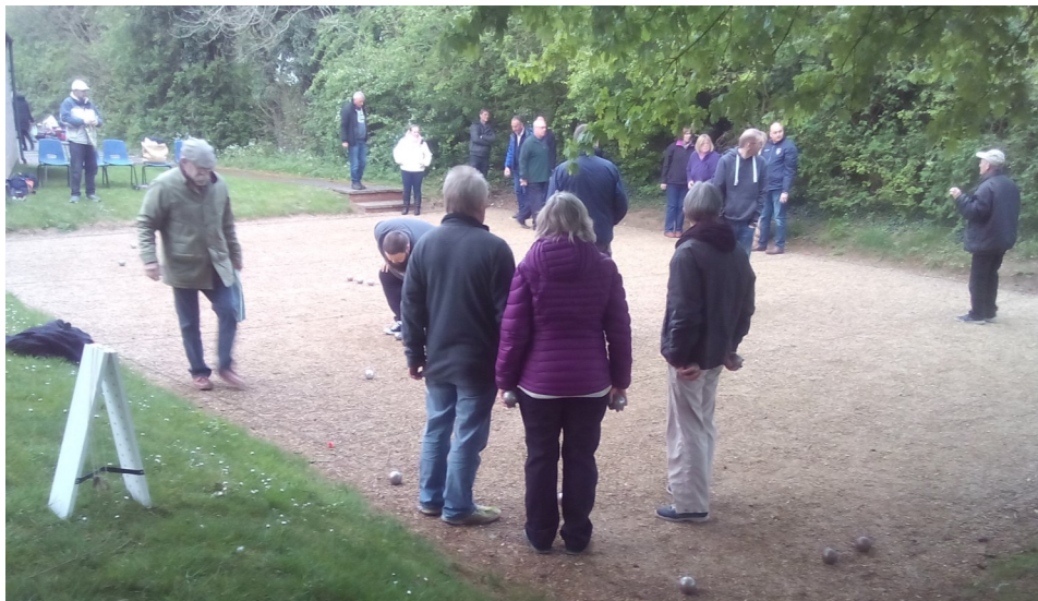
Start of Greetham Vikings petanque season