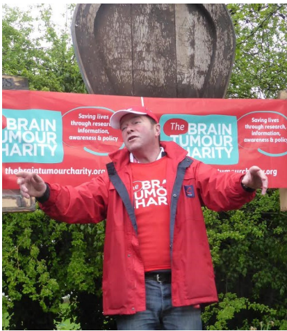
Greetham's Duck Race