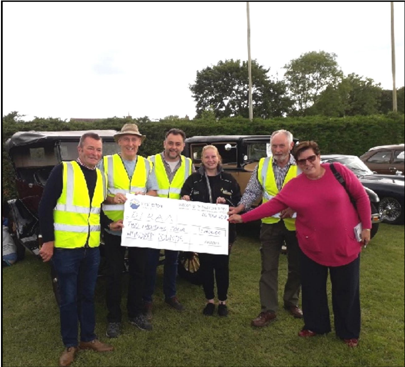
Greetham Gathering presenting cheque to Air Ambulance