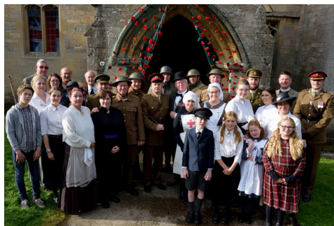
The cast for previous show 'Somme of Greetham'

There won't be any lengthy scripts to memorise, and the