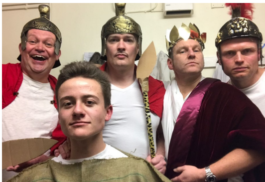
The Wapscallions (The Romans)