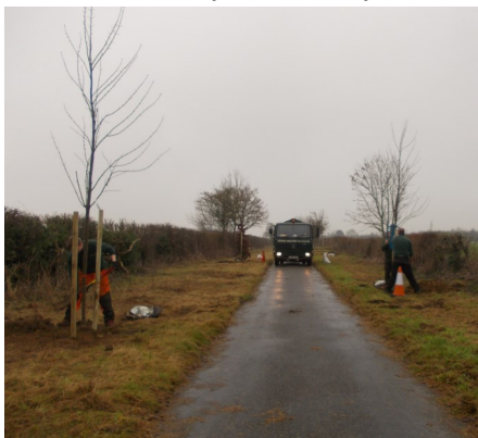
Great Lane tree planting