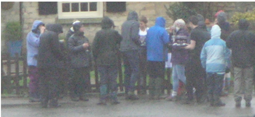
Not a very nice day for the New Year's Day walk!