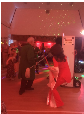
What was in the box?