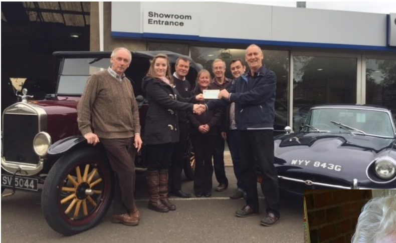
Presentation of cheque from The Gathering