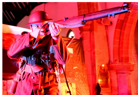
Image from previous show 'Somme of Greetham'

This production follows on from our successful "Somme of Greetham" and "Greetham's Great War Heroes", two sell-out shows from 2014 and 2018. For those who remember them or were involved, we are aiming for